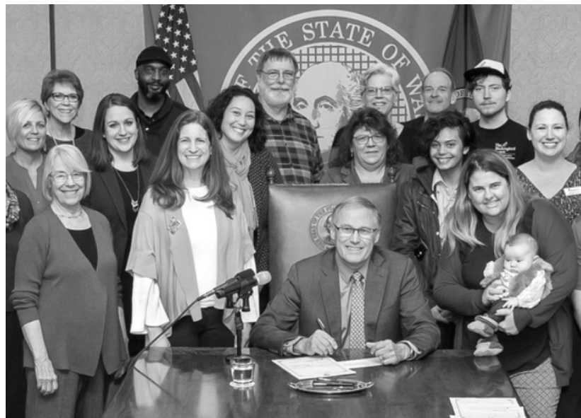
Gov. Jay Inslee, Coordinated Care staff and partners at the bill signing.